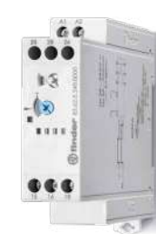
83 Series Modular timers, 22.5 mm