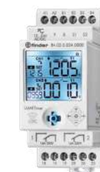
84 Series SMARTimer