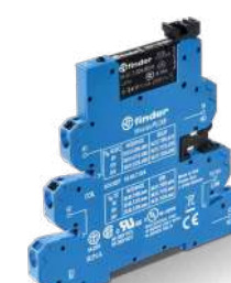
39 Series Relay interface modules, 6.2 mm