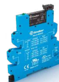
39 Series Relay interface modules, 6.2 mm