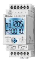
84 Series SMARTimer