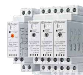
15 Series Dimmers