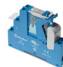
48 Series Relay interface modules, 15.8 mm