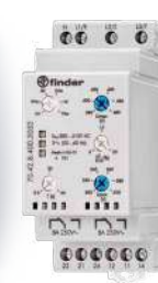
70 Series Monitoring relays