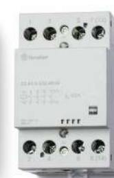
Type 72.42 Relay for alternating loads