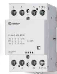
22 Series Modular contactors