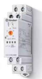
13 Series Electronic relays