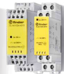
7S Series Modular relays with forcibly guided contacts