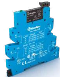
39 Series Relay interface modules, 6.2 mm