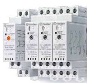
15 Series Dimmers