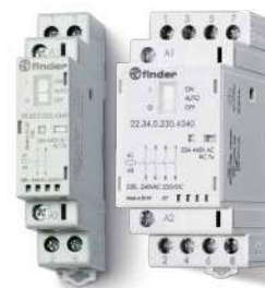
22 Series Modular contactors

Automation and lighting management for entertainment control systems 39 / 15 / 78 Series