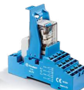
58 Series Relay interface modules, 27 mm