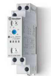
80 Series Modular timers, 17.5 mm

Auxiliary propulsion systems 48 / 4C / 58 / 62 Series