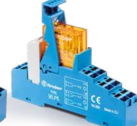
48 Series Relay interface modules, 15.8 mm