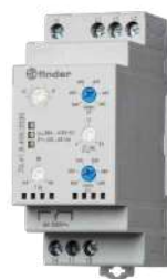
70 Series Monitoring relays