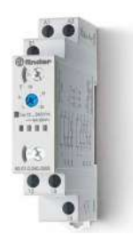
80 Series Modular timers, 17.5 mm