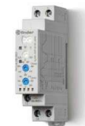
70 Series Monitoring relays