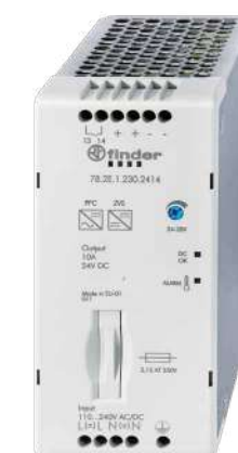
78 Series Switch mode power supplies