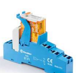
4C Series Industrial interface modules, 15.8 mm