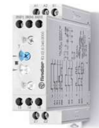
83 Series Modular timers, 22.5 mm