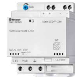
78 Series Switch mode power supplies