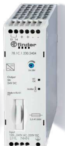
78 Series Switch mode power supplies