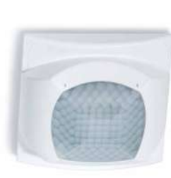
18 Series PIR movement detectors