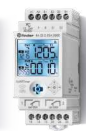
84 Series SMARTimer